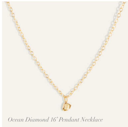
Ocean Diamond 16' Pendant Necklace