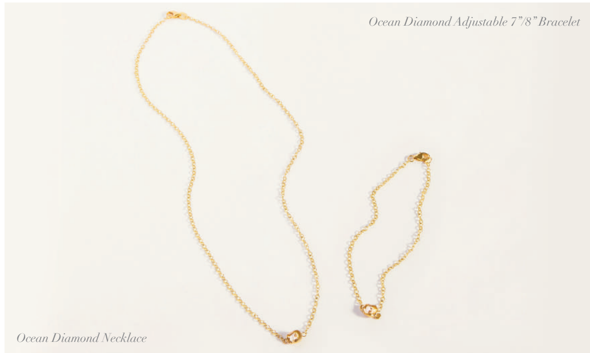
Ocean Diamond Adjustable 7 7/8" Bracelet