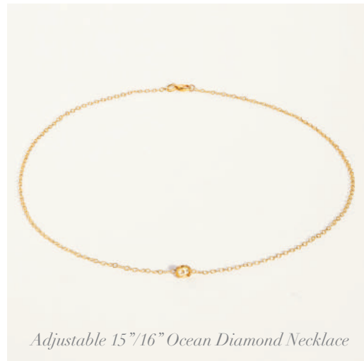
Adjustable 15"/16" Ocean Diamond Necklace