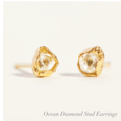
Ocean Diamond Stud Earrings