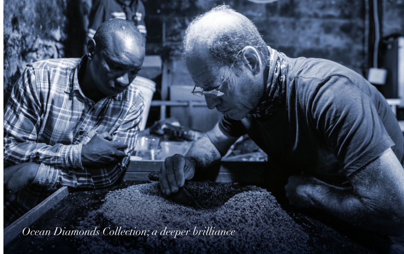
Ocean Diamonds Collection; a deeper brilliance