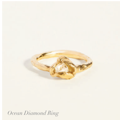
Ocean Diamond Ring

COASTAL ORIGIN CONSCIENCE CRAFTSMANSHIP CERTIFIED