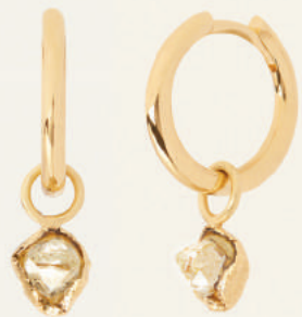
Ocean Diamond Hoop Earrings

A story of courage, discovery; depth and radiance. These diamonds are wild, brilliant and deeply compelling; a chance to carry the ocean with you, always