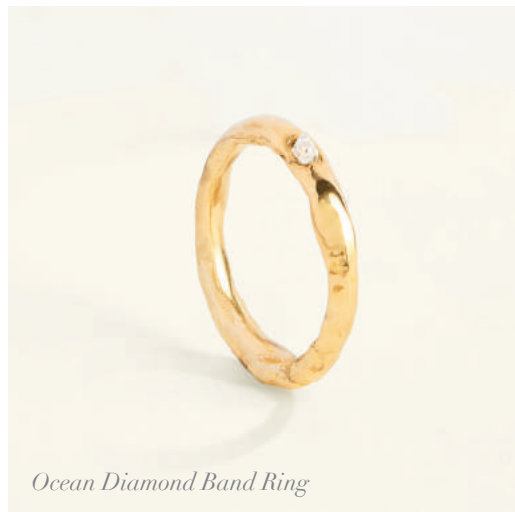
Ocean Diamond Band Ring